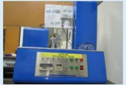
Pry Durability Tester