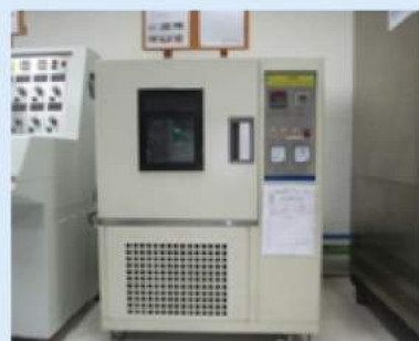
High & Low Temperature Testing Chamber