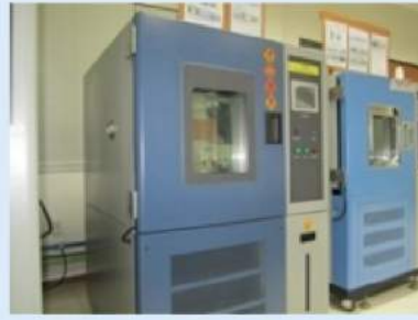
Prog. Temperature & Humidity