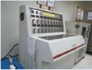
Temperature Rising Chamber