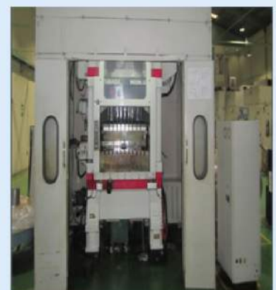
PRESS MACHINE DOBBY MXM