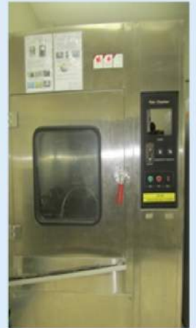
Rain Chamber Tester