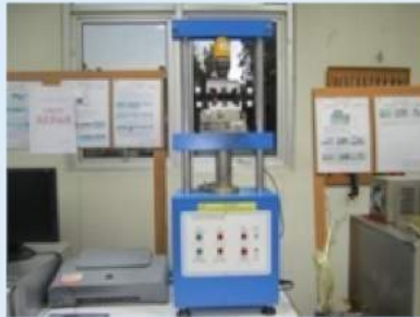
Auto Insert & With Draw Forced Tester