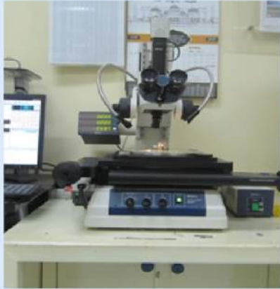
Mitutoyo Measuring Microscope