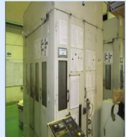
PRESS MACHINE BASIC