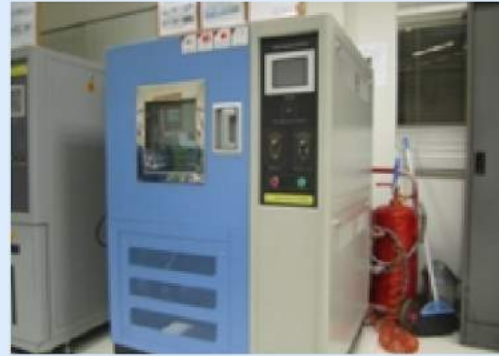
Ozone Aging Chamber