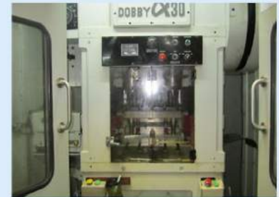
PRESS MACHINE DOBBY α 30