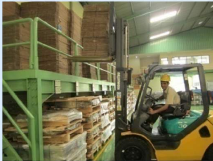
"Raw Material" Handling