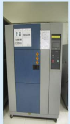
Thermal Shock Chamber