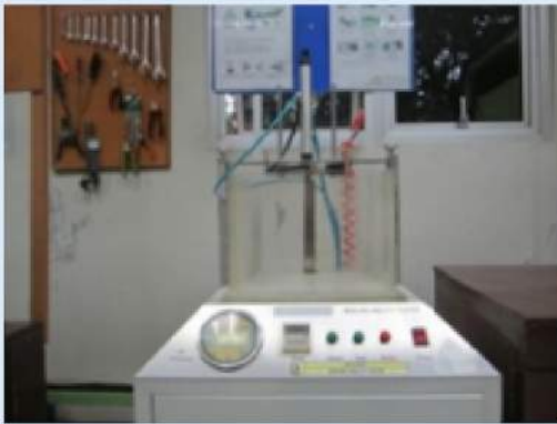
Sealing Ability Tester