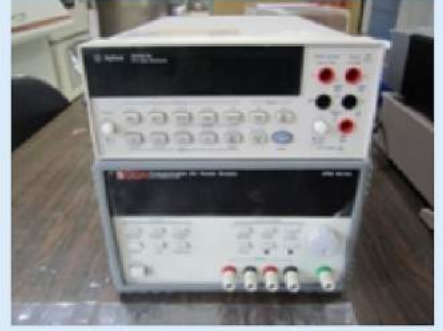
Voltage Drop Tester