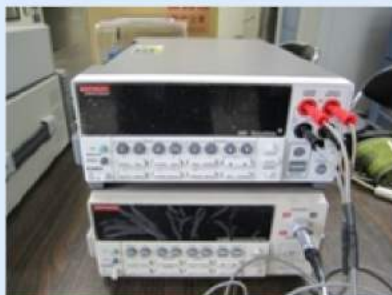
Low Voltage & Low Current Resistance Tester