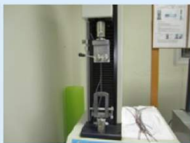
Tensile Strength Tester