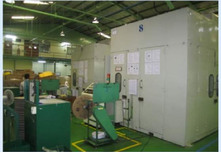
PRESS MACHINE AIDA