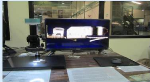
Digital Microscope BC 3609