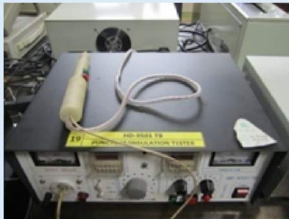
Puncture/Insulation Tester (High Voltage Tester)