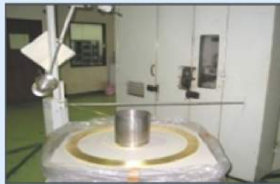
PRESS MACHINE XUANG XIANG