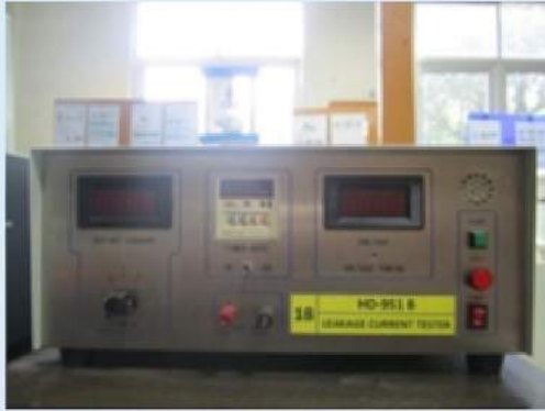
Leakage Current Tester