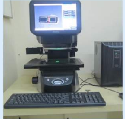
Keyence Dimension Measuring System